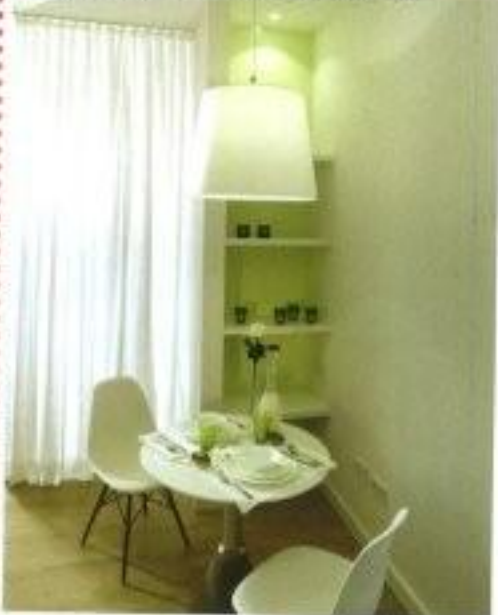
Philippe Starck creates a bright dining space

Over the past ten years, Yoo has been working with international partners on a variety of landmark buildings and large residential projects throughout Asia, Australia, Europe, North and South America and the Middle East. Currently Yoo is involved in the development of more than 10,000 apartments valuing over $7 billion in 27 countries and has been successful in achieving consistent sales premiums of 5% - 15% for its partners on all projects till date. ■