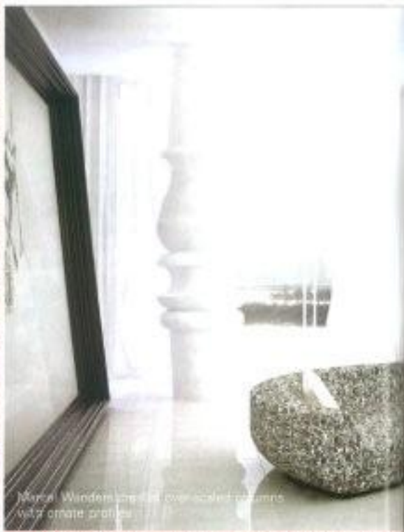
Marcel Wanders' oversized over-coated columns with ornate profiles.

With the help of these palettes, Yoo is trying to create specific and clearly defined designs influ-